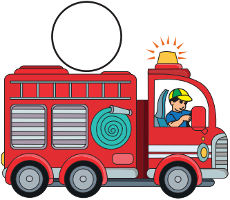
Figure out the vehicle that matches each profession and write the corresponding number atop the picture.